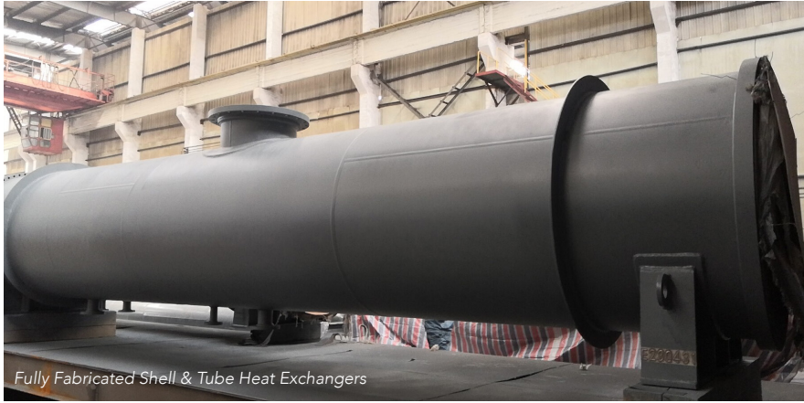
Fully Fabricated Shell & Tube Heat Exchangers