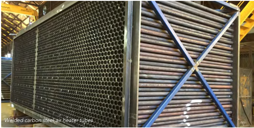
Welded carbon steel air heater tubes